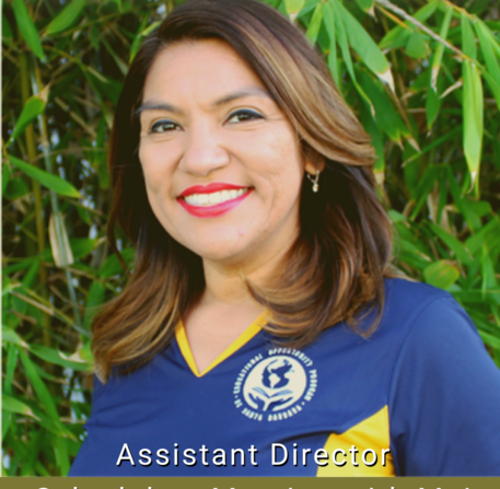
Assistant Director Schedule a Meeting with Me!