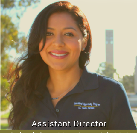
Assistant Director Schedule a Meeting with Me!