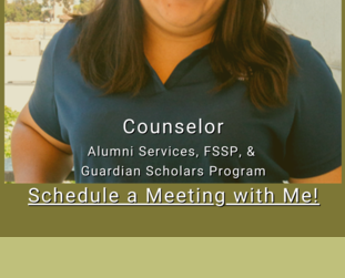
Counselor Alumni Services, FSSP, & Guardian Scholars Program Schedule a Meeting with Me!