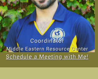
Coordinator Middle Eastern Resource Center Schedule a Meeting with Me!