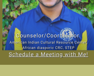
Counselor/Coordinator American Indian Cultural Resource Center African diasporic CRC, STEP Schedule a Meeting with Me!