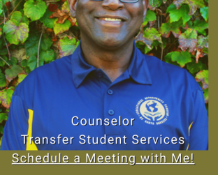
Counselor Transfer Student Services Schedule a Meeting with Me!