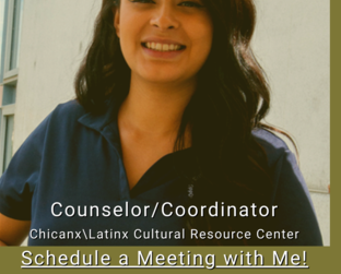
Counselor/Coordinator Chicana/Latina Cultural Resource Center Schedule a Meeting with Me!