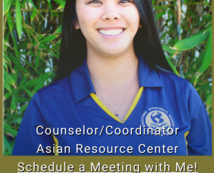
Counselor/Coordinator Asian Resource Center Schedule a Meeting with Me!