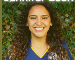
Counselor/Coordinator Scholars Programs Schedule a Meeting with Me!