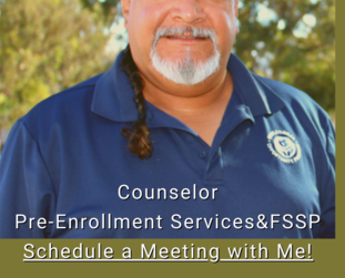
Counselor Pre-Enrollment Services & FSSP Schedule a Meeting with Me!