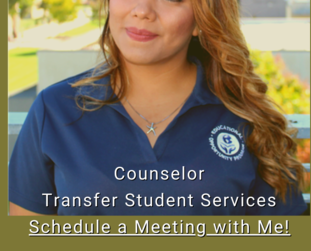
Counselor Transfer Student Services Schedule a Meeting with Me!